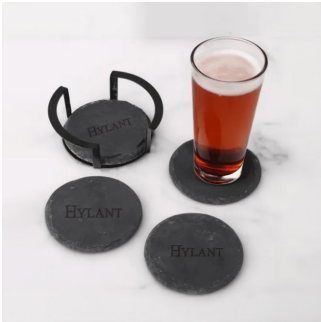
*Holder not included. Coasters wrapped individually.

Item # IDGXH-OJTKY Color: Charcoal Gray w/Laser Engraving Logo: Hylant